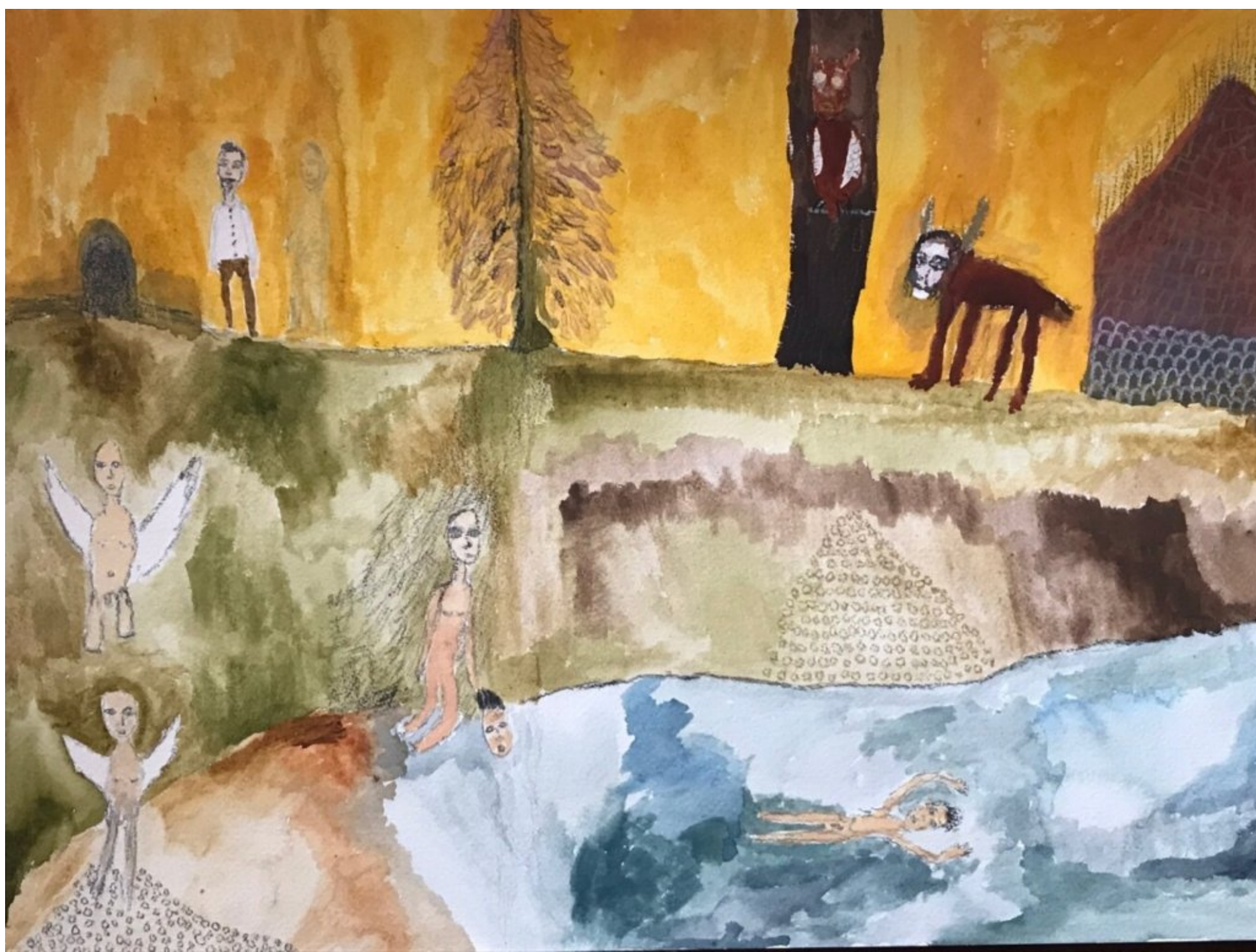
Gregory Jamie, "Untitled 20," watercolor and graphite on paper, 14 x 20 inches.

There's no connection between the watercolor works in "Eau, the Water" (through Nov. 27) and Tim Greenway's large-scale photographs in "Refined Resurgence" (through Dec. 11), two shows currently at Cove Street Arts. They're interesting for different reasons, but equally absorbing.